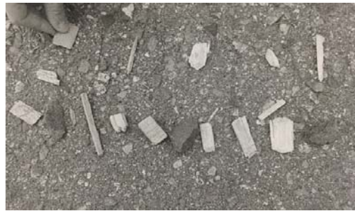
Patterning during Outdoor School - Division 9

Thank you to both parents and staff for supporting our school community so far this term. It has been a very positive start to our school year with many fun and creative experiences taking place. We have many more busy times ahead and we look forward to continuing to connect with our parent community to celebrate our students and their amazing accomplishments.